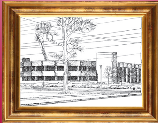
735 WEST NEW YORK STREET